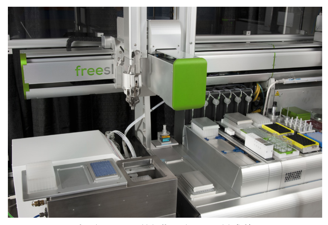
freeslate system with buffer exchange module (left)

Freeslate lets you skip the dialysis cassettes, desalting columns and trips to the centrifuge that come with manual processes. It automates plate-based buffer exchange with as little as 150 \mu L of sample. Churn out more protein formulations and use the time you get back for the other big things on your to-do list.