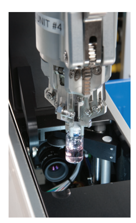
Visual inspection station