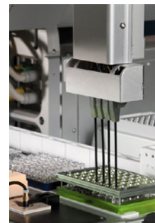
Multi-channel pH probes