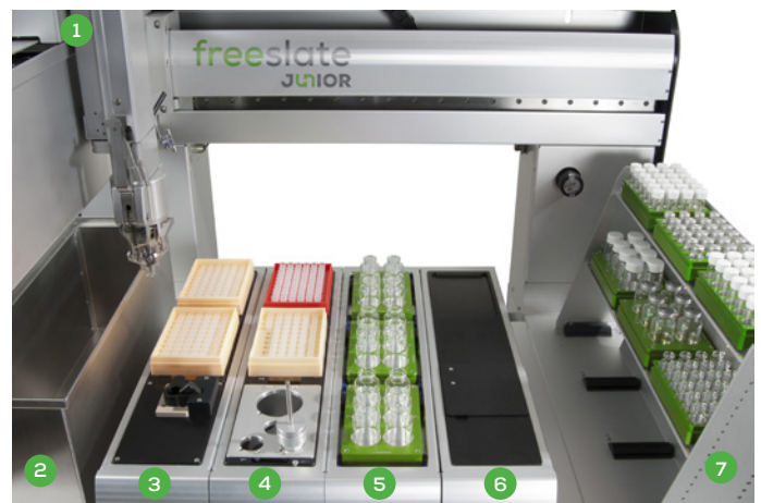
Example freeslate jr. deck configured for biologics formulation