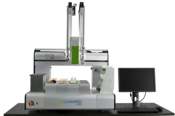
freeslate jr. configured for biologics formulation