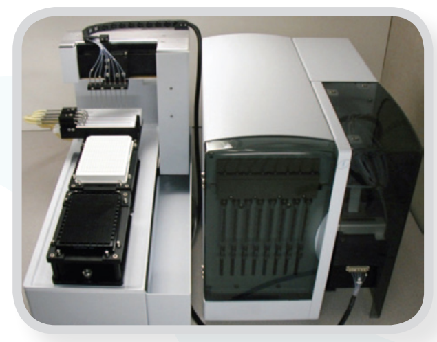
Nanodrop II Low-Volume Automated Pipettor 8 Channels.

The Nanodrop technology aspirates and dispenses a broad range of liquids, including DMSO, and features the Nanobuilder software system that enables a wide range of applications and data manipulation. This patented technology isolates the solenoid dispense actuators from the sample path to assure long life and easy, low-cost maintenance — even with regular use of difficult suspensions such as proteins, cells and YOx beads.