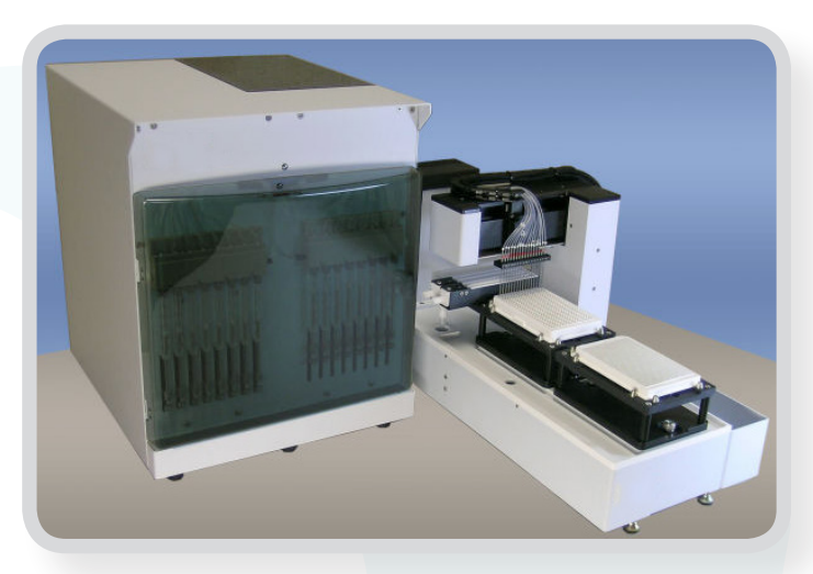
Nanodrop Express Low Volume Automated Pipettor 16 Channels.