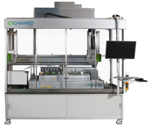
freeslate configured for biologics formulation