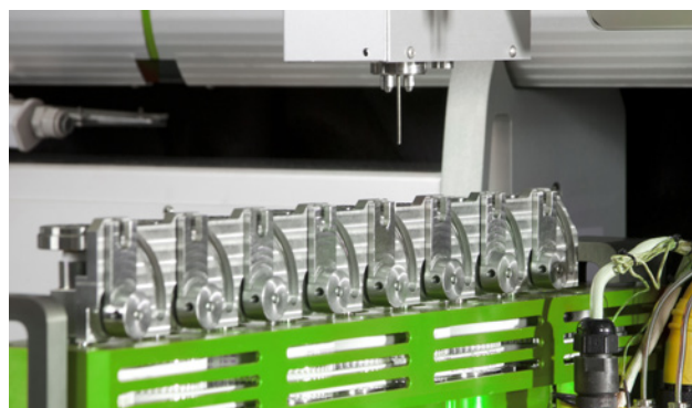
Optimization sampling reactor (OSR)