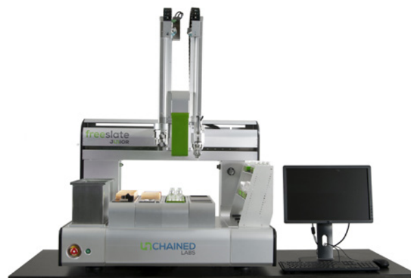
freeslate jr. configured for reaction optimization