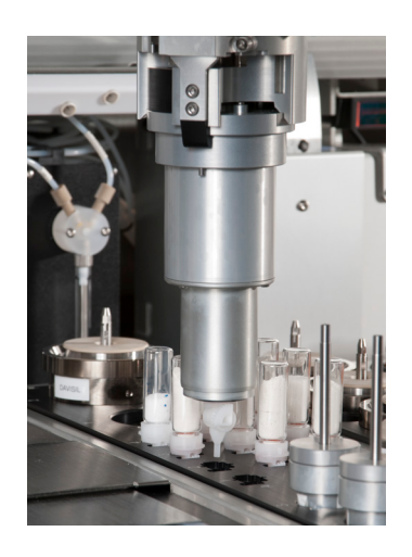
Solid dispensing tools

Freeslate screens all your substrates, catalysts, reactants, solvents and reaction conditions so you can tackle a huge range of organic transformations. Dead-on dosing of small amounts of solids, liquids, slurries and viscous reagents keeps use of precious and expensive materials at an all-time low when prepping your reaction solutions. Tight reaction control, stir plate temps, filtration and dilution means your samples are ready for structural analysis whenever you are.