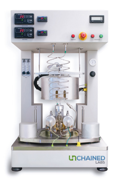
Screening Pressure Reactor

Ultra-high temp and pressure reactions are no problem with the Screening Pressure Reactor (SPR). Run up to 96 experiments in parallel automatically and kick things up to 400 °C and 200 bar (3000 psig). Tie an SPR in with freeslate for reaction screening and see if maxing temps and pressures gets your chemistry where you want it to go.