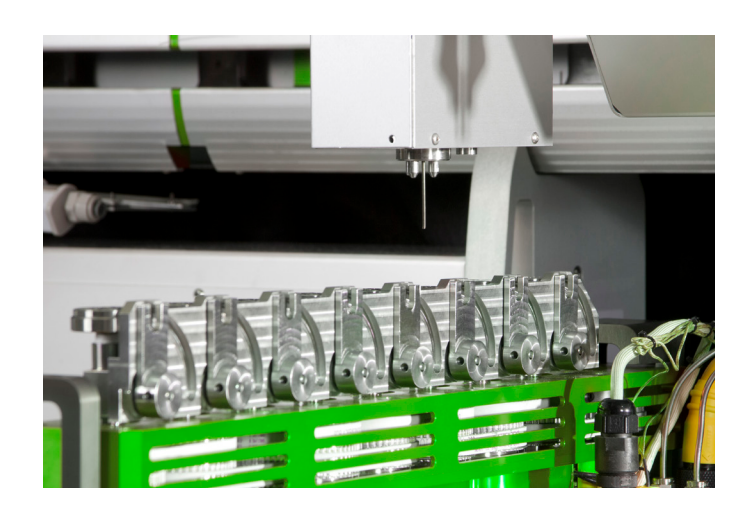
Optimization Sampling Reactor

Going the one variable at a time route doesn't cut it when you need to know how all your different reaction variables play together. Add an Optimization Sampling Reactor (OSR) to freeslate and get real-time kinetics on all your reactions. OSR grabs time-point samples from up to 8 pressure and temp-controlled vessels at a time without interrupting a single reaction. Each vessel makes sure the heating, cooling and stirring for each of your reactions is just right.