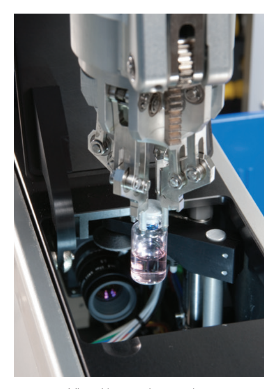
Visual inspection station

Freeslate jr. does a 3-in-1 visual inspection using a fast, non-destructive assay. Grab color, turbidity and count visible particles all in one shot. It also takes a snapshot of every sample and matches those up against standards. That means you get a more accurate analysis without all the subjectivity. Images are permanently archived so you can go back and check them out anytime.