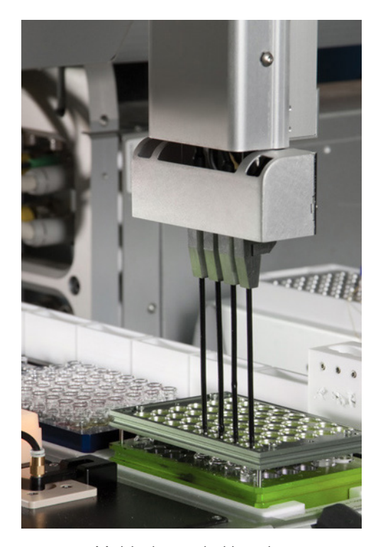
Multi-channel pH probe

One at a time pH measurements just don't cut it. Freeslate jr.'s high-resolution, 4-probe pH arm automates the whole process. It blasts through a 96-well plate in less than 30 minutes – that includes calibrations, measurements, recording and washing. So no more prep, no more mess, and no more standing at the bench.